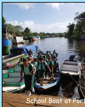
School Boat at Port Kaituma, Guyana