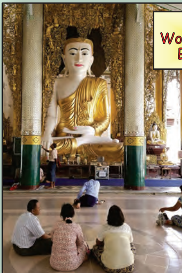
Left: Worshipping Buddha